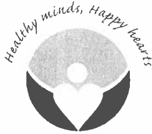
Exhibit S-2 August 9, 2021